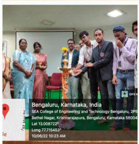
Bengaluru, Karnataka, India SEA College of Engineering and Technology Bengaluru, 2P56+667, Bethel Nagar, Krishnarajapura, Bengaluru,